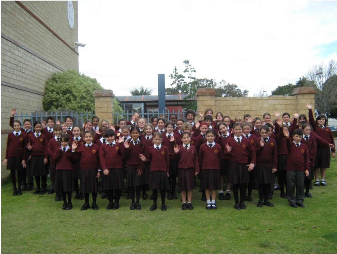
CHOIR'S PAST ACHIEVEMENTS Performing Arts 2009