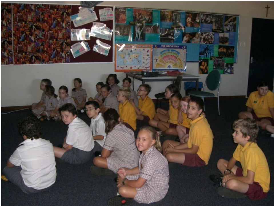
Choir Rehearsal Year 3 to 6 children 2011.