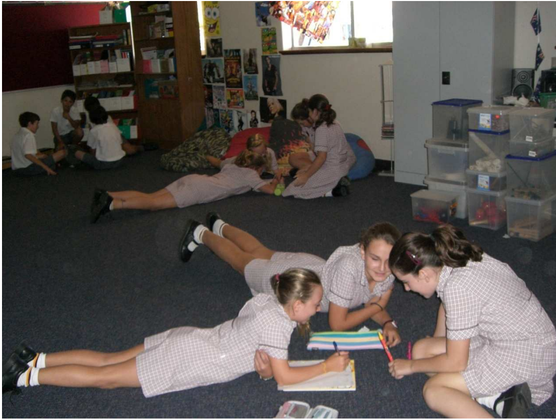
Year 6 students using their skills to compose lyrics.