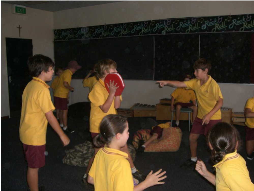
STUDENTS SHOWING THEIR ACTING SKILLS DURING DRAMA.