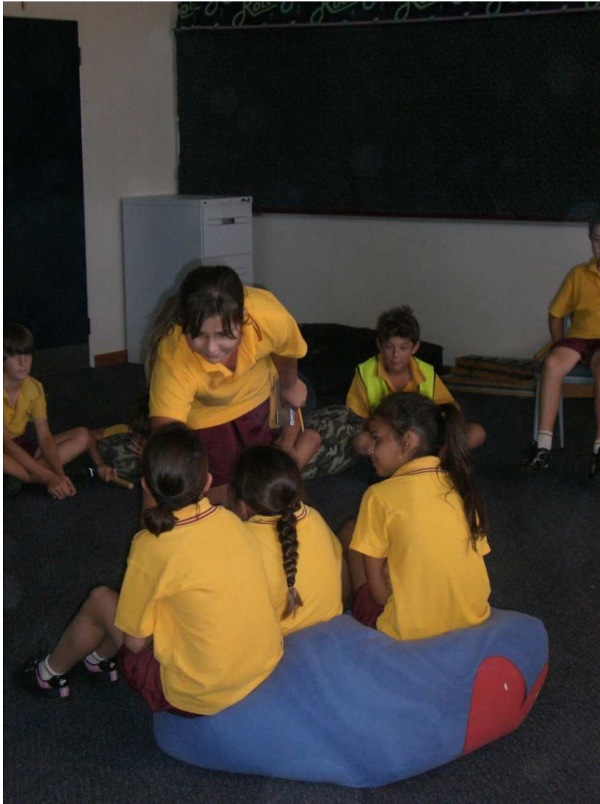
YEAR 5 STUDENTS SHOWING THEIR ACTING SKILLS IN DRAMA.