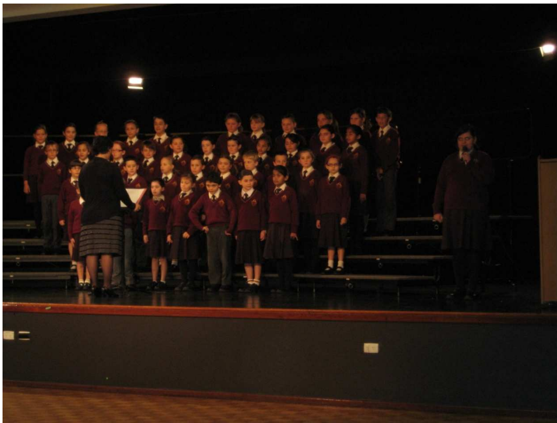
CHOIR'S PAST ACHIEVEMENTS Performing Arts 2010