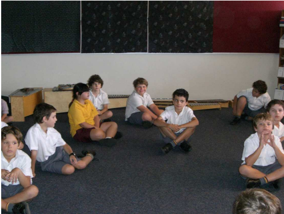
Students playing musical bobs.