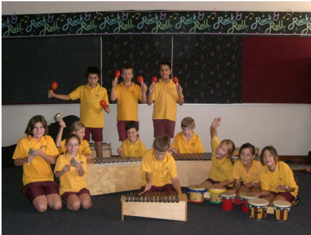
Year 5Gold performing during music time.