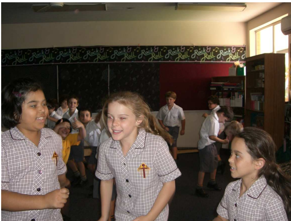
Students dancing and playing musical bobs.