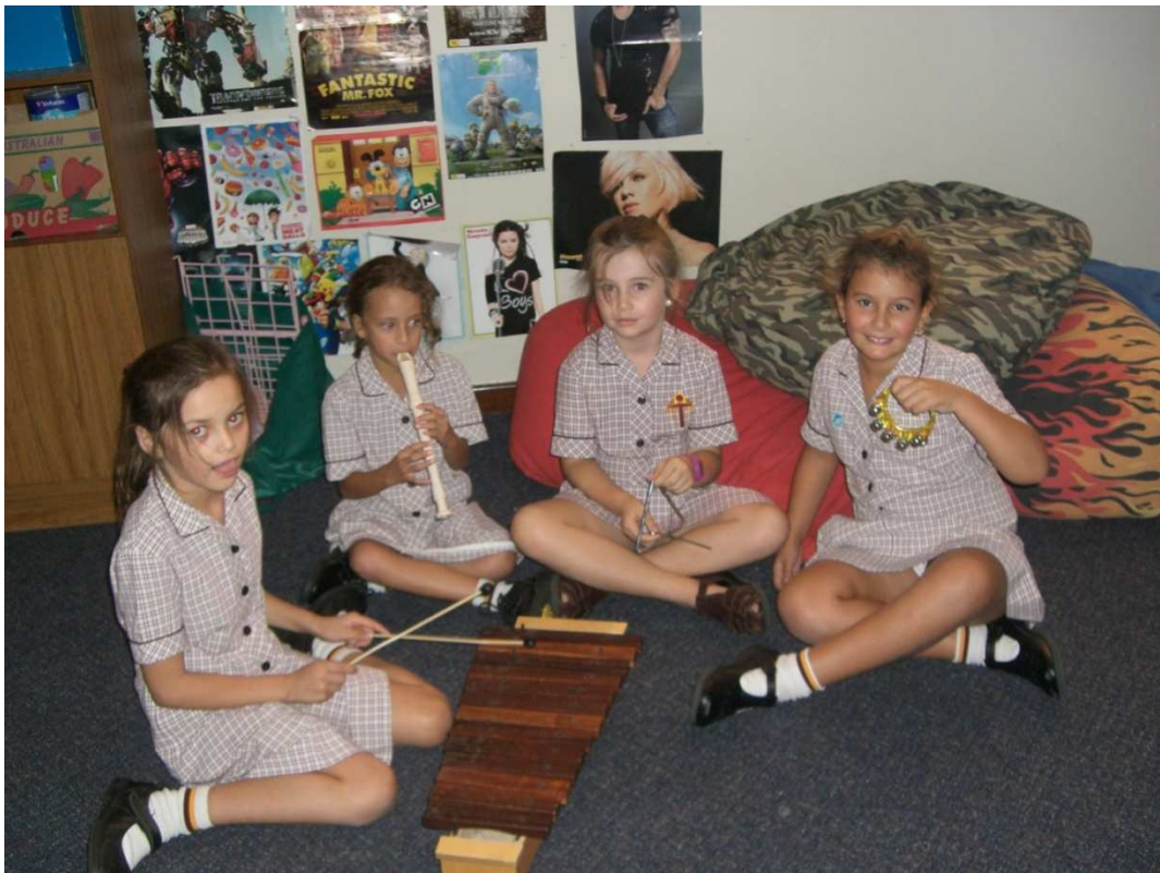
YEAR 36 GOLD STUDENTS PLAYING SWEET MUSIC.