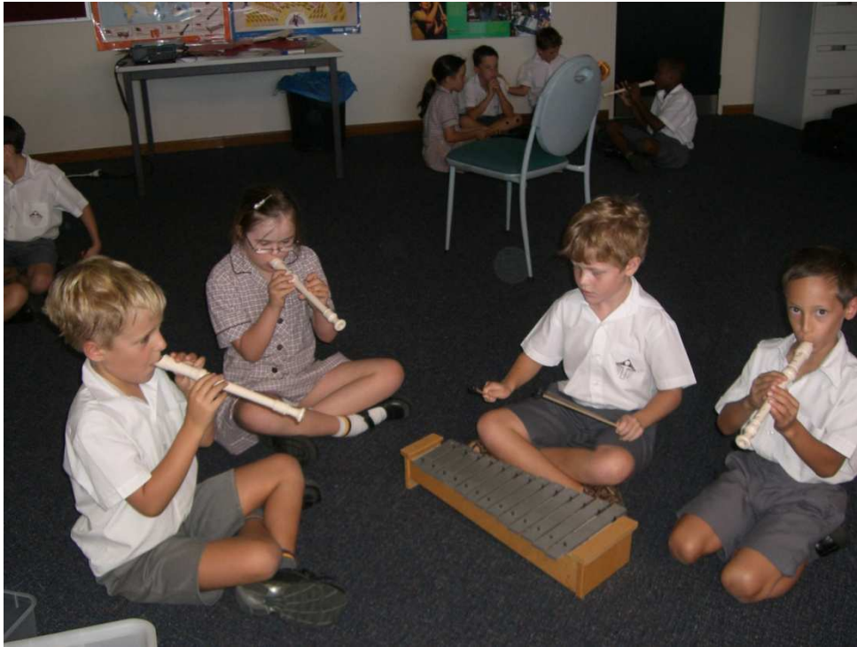
YEAR 36 GOLD STUDENTS PLAYING SWEET MUSIC.