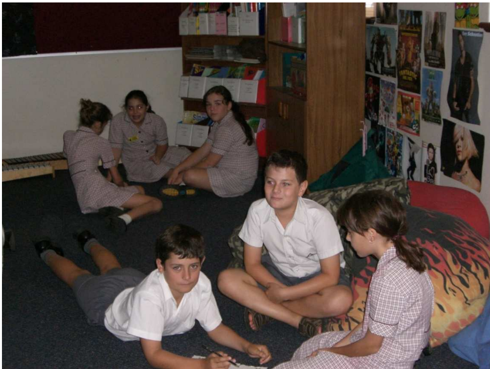
Year 6 students using their skills to compose lyrics.