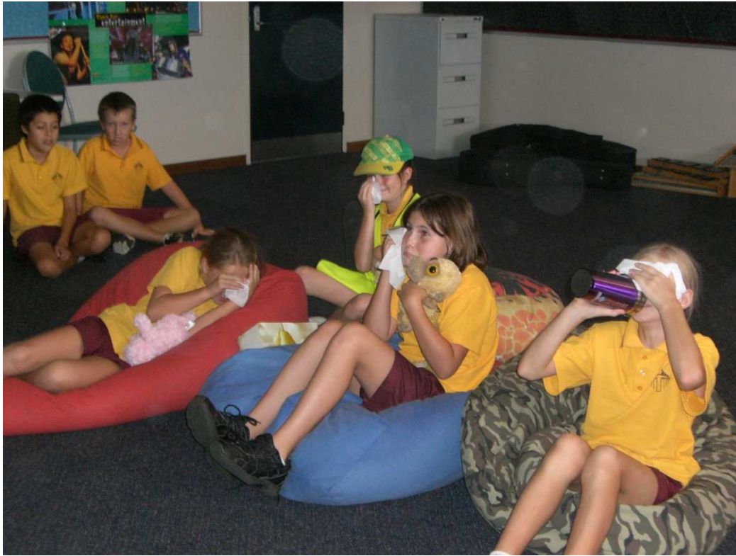
STUDENTS SHOWING THEIR ACTING SKILLS DURING DRAMA.