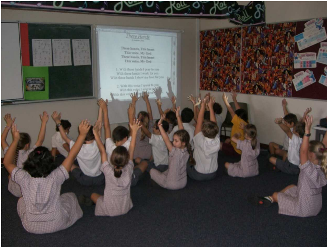
YEAR 3RED PRACTICING THE SONG FOR THEIR PRAYER SERVICE.